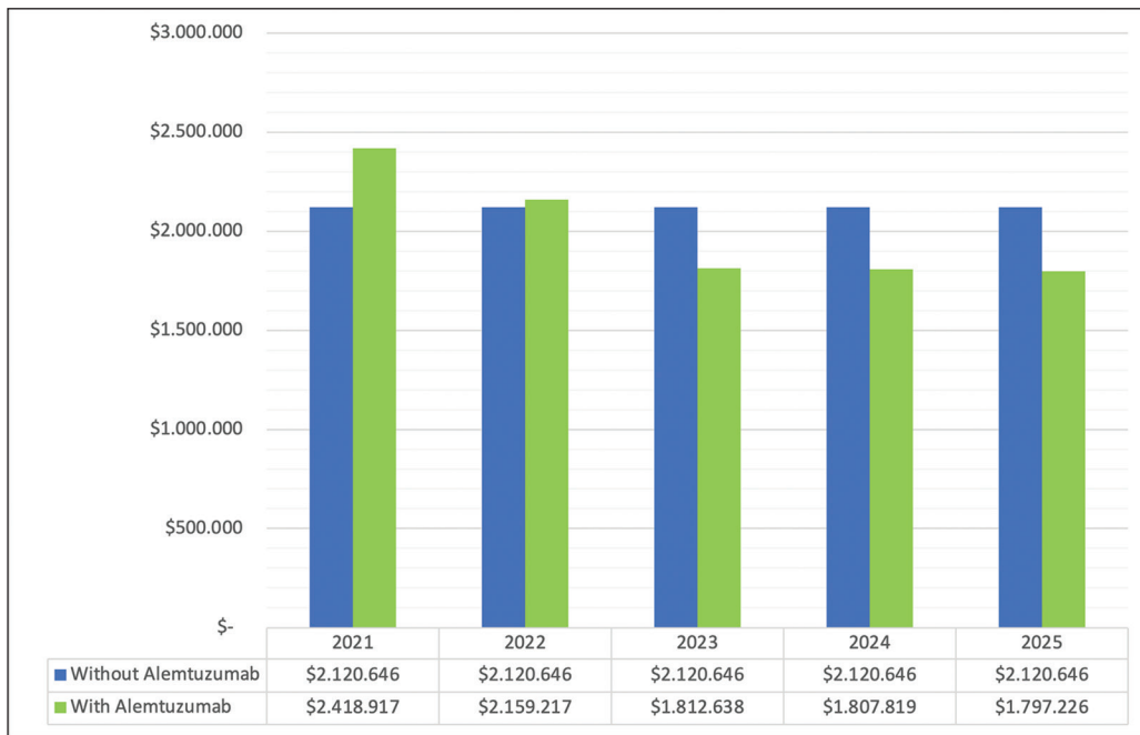
Fig. 1 - Budget impact in base case and alternative case.